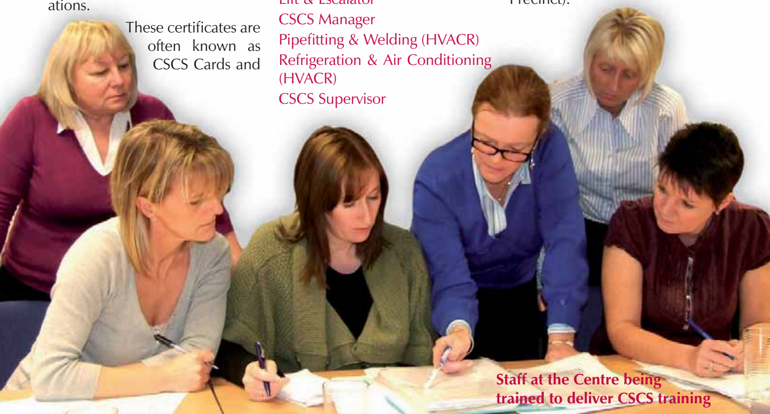
Staff at the Centre being trained to deliver CSCS training

For more information, call Step Ahead on 0161 368 2096, e-mail stepahead@hnp.org.uk or call in to the Hattersley Neighbourhood Partnership office at 10-13 Kingston Arcade (Hattersley Precinct).