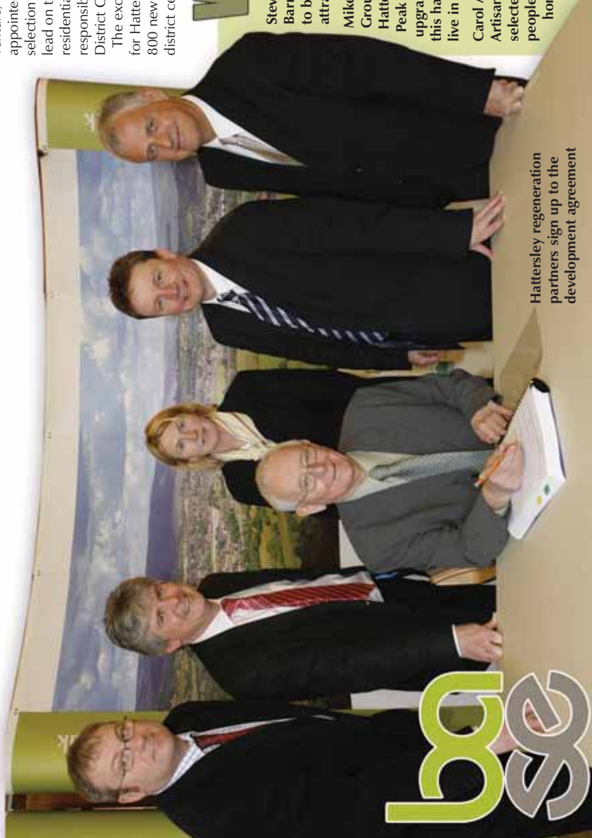
Hattersley regeneration partners sign up to the development agreement